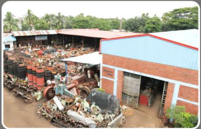
CHATTOGRAM (CHITTAGONG) (IN COLLABORATION WITH WESTERN MARINE SERVICES)